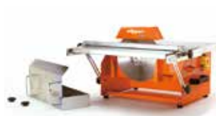
REMOVABLE WATER TANK