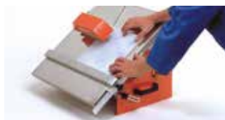
TILTING TABLE (0° TO 45°)