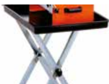
OPTIONAL FOLDING LEGS ITEM N° 00310004597